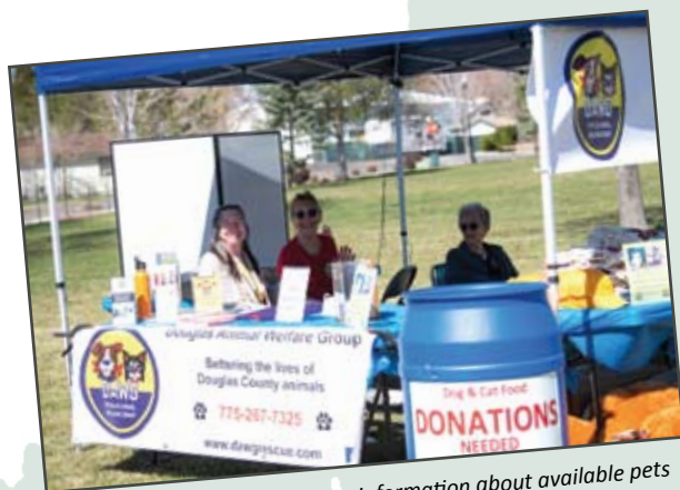
DAWG volunteers love sharing information about available pets and DAWG programs at their booth.