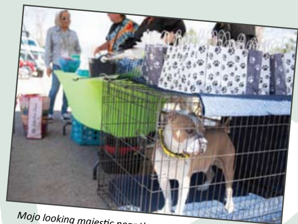
Mojo looking majestic near the swag bags. Lucky guy has since found his forever home!